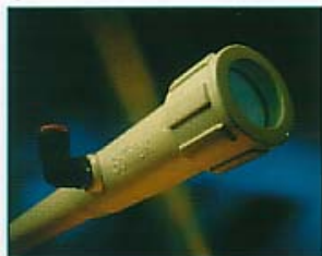
SpinTek™ Filtration Tubular Ultrafiltration Membranes provide superior performance as direct tube replacements in existing in-plant systems.