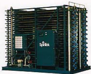
SpinTek's Membrane Products Group specializes in solutions for waste and process streams formerly considered untreatable.