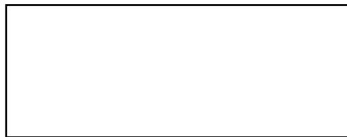
AirSep "AS-D" Oxygen Generator Feed Air Requirement (93% nominal oxygen)

Commercial Products Division 260 Creekside Drive Buffalo, NY 14228-2075 U.S.A. Tel: (716) 691-0202 Fax: (716) 691-1255 URL: http://www.airsepcpd.com E-mail: cpd@airsep.com